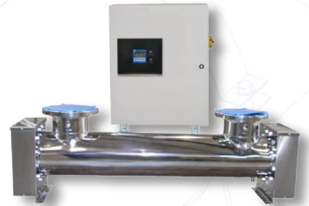
Optima HX 08EDL