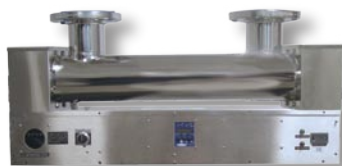
Optima HX 02DDS