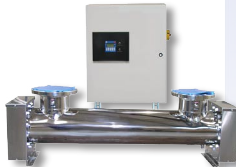
Optima HX 08EDL